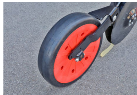
7 cm wide press wheel – ideal on light soils