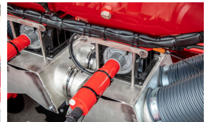
Pressurised hopper system with locking option