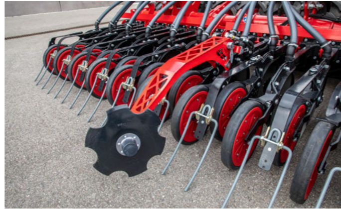
The aggressiveness of the pre-emergence marker is adjusted via a depth stop

The pre-emergence markers are recommended for crops that require maintenance measures before the laid tramlines become visible. They are controlled fully automatically via the tramline rhythm of the terminal. The mounting on the seed coulters allows for a precise depth control via the press wheel. The aggressiveness of the pre-emergence marker is adjusted via a depth stop.