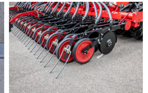
HORSCH TurboDisc seed coulters