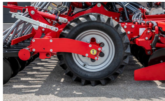
Low horsepower requirement due to large tyre diameter and no scrapers required