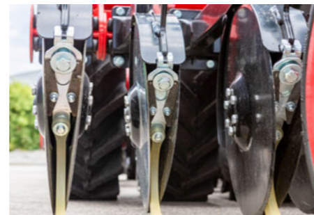
The movable scraper ensures a high self-cleaning effect in wet conditions