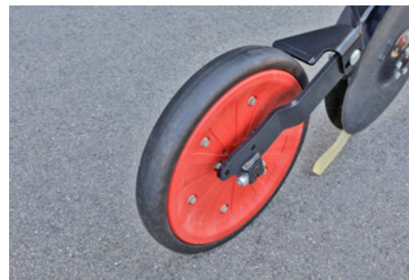
5 cm wide press wheel – ideal on medium and heavy soils