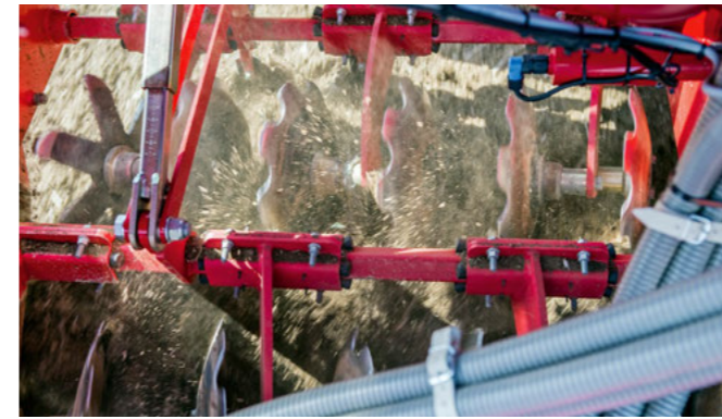
Efficient crumbling and even levelling over the whole working width