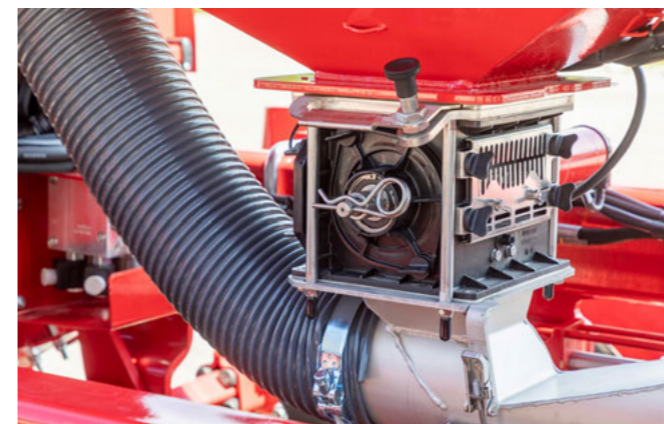
Metering unit – injector hopper system with valve