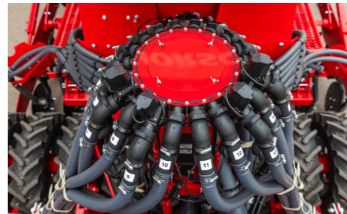
Monitoring of the pneumatic flow at the distribution tower