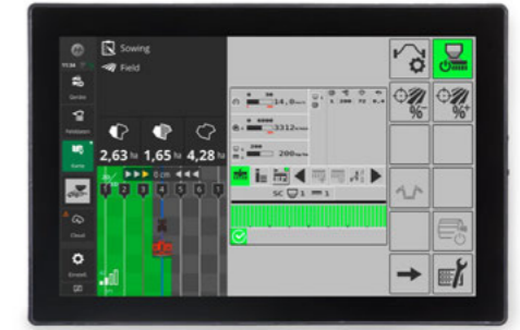
By displaying up to 3 widgets in addition to the main working screen, the user can keep track of several applications at the same time.