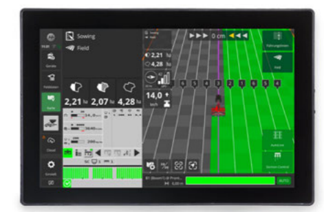
Drill independently of the track rhythm with universal seeding technology and HORSCH AutoLine