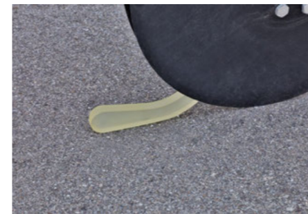
The HORSCH Uniformer ensures a precise fixing of the seed