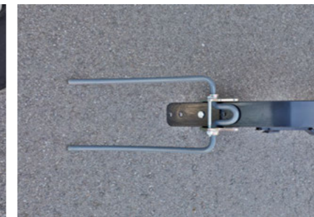
The straight harrow – TurboDisc seed coulters harrow is controlled individually for a more efficient tillage