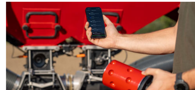
The HORSCH Assist app with the „Rotor Selection“ function helps you to choose the optimal rotor for each application.