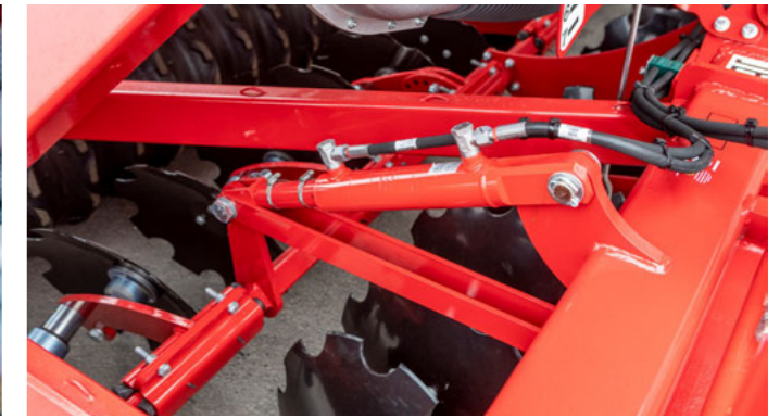
DiscSystem hydraulically adjustable with well-known depth indicator