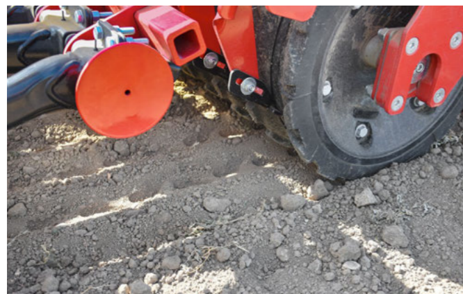
The FarmFlex packer reduces crusting due to strip consolidation.