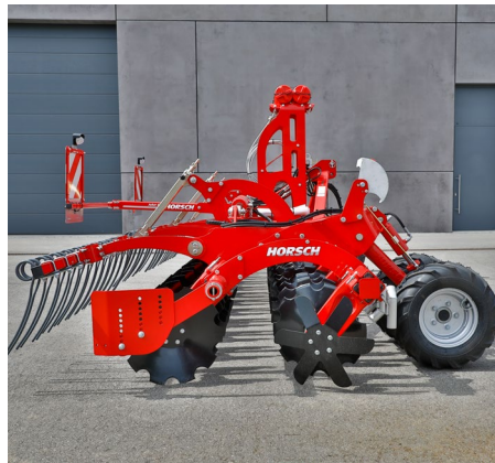
Liquid manure version without packer, with harrow to guarantee a low susceptibility to clogging