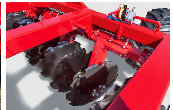
Large discs with a diameter of 62 cm