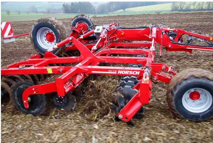
Large disc spacing for maximum clearance in the machine