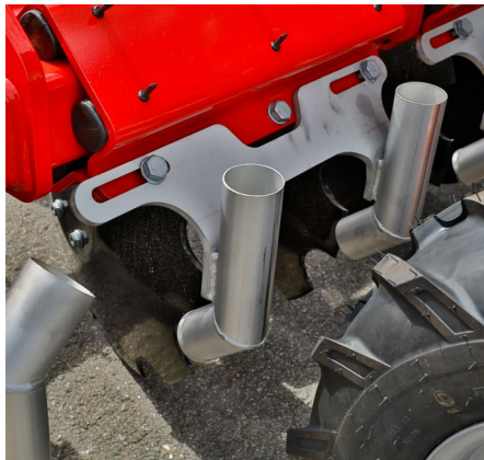
Stainless steel liquid manure outlets for long service life