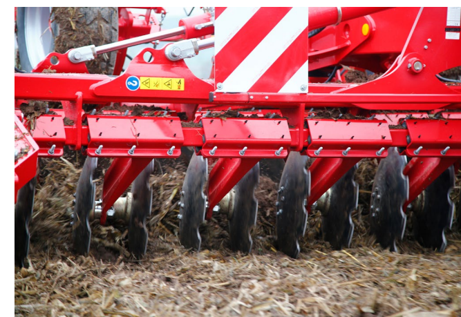
Width of disc bearing on the frame for exact control of the discs in the soil

Depending on the requirements and scope of application of the machine, the Joker HD can be equipped with some additional equipment. The machine can either be equipped with a seed bar for seeding catch crops or similar crops or with a liquid manure kit for the incorporation of organic fertilisers. Depending on the equipment of the tractor, the farmer can choose between linkage in the lower links in Cat. III or VI or linkage in the adjustable drawbar. Due to this and other options the Joker HD can be adapted optimally to the requirements of the farmers. The double RollPack packer with a diameter of 55 cm ensures optimum consolidation. At the same time, the packer ensures a safe depth control of the machine on light soils without a build up of soil. For road transport the packer is equipped with transport wheels. This allows for a comfortable road transport and the machine is protected.