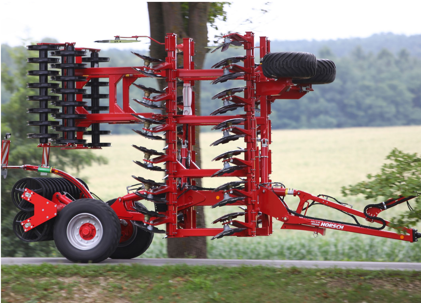
Transport position Joker HD