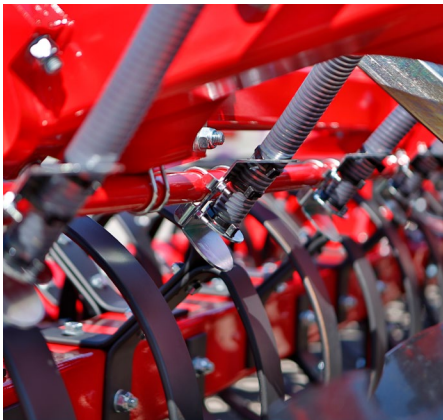
Seed bar for seeding catch crops in one pass